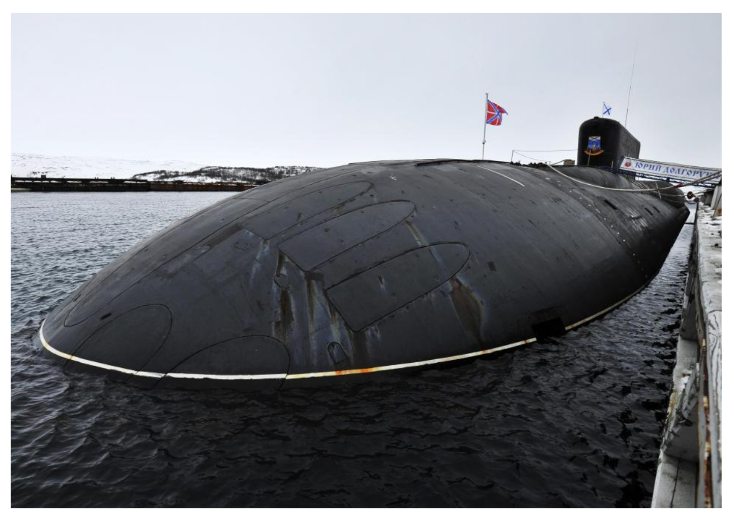
Russia's Yury Dolgoruky nuclear-powered ballistic missile submarine prepares to leave the Russian Northern Fleet base in the town of Gadzhiyevo last week

The increase in Russia's military capacity comes amid tensions with the West over Ukraine, the Baltic states and Moscow's meddling in the Syrian civil war.